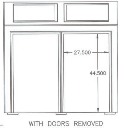
WITH DOORS REMOVED